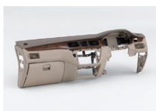
Automobile instrument panel made of polypropylene