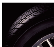
A tire made using synthetic rubber