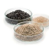
Super engineering plastics