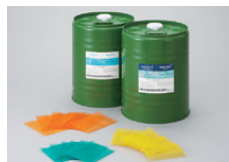
Products used for insecticides