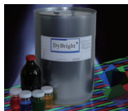
Color Resists "DyBright™"