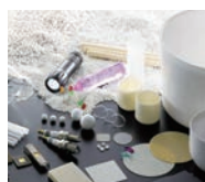
Products made using alumina and alumina powder

The Energy & Functional Materials Sector provides a wide variety of functional chemical products that contribute to reducing the environmental impact and conserving energy and natural resources, including inorganic materials such as alumina used in energy-saving products, high-performance polymer additives, super engineering plastics and lithium-ion secondary battery material used in electronic components and next-generation vehicles.