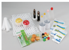
Various products made using polyethylene