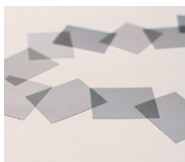
Polarizing films "SUMIKARAN™"

The IT-related Chemicals Sector provides a wide range of products to support the age of IoT: optically functional films, touch screen sensor panels, color resists and polymer OLED materials that are used to make LC and OLED displays; photoresists and high-purity chemicals required in the semiconductor manufacturing process; compound semiconductor materials used in antenna switches and other components of communication terminal equipment.