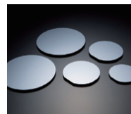
Compound Semiconductor materials