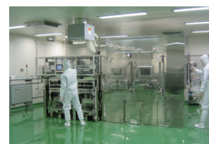
Manufacturing of PET radiopharmaceuticals