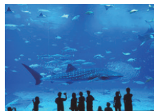
Large aquarium panel made of methyl methacrylate