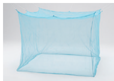
Olyset™Plus, long-lasting insecticidal mosquito net for malaria prevention