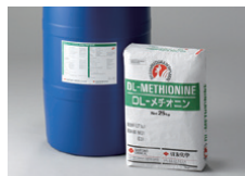
DL-methionine and methionine hydroxy analog used as feed additives