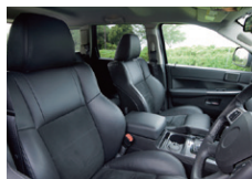
Automobile seats with cushion materials made using propylene oxide as a raw material

The Essential Chemicals & Plastics Sector has manufacturing facilities in Japan, Saudi Arabia, and Singapore, and leverages the strengths of each of these facilities to manufacture synthetic resins such as polyethylene, polypropylene, and methacrylic resin, as well as raw materials for synthetic fibers, and various industrial chemicals. Through these operations, Sumitomo Chemical meets the diverse needs of customers by providing chemical products that underpin a variety of industries.