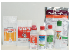
Various crop protection chemicals, including insecticides and herbicides

The Health & Crop Sciences Sector is engaged in the manufacture and sale of crop protection chemicals, fertilizers, feed additives, household insecticides, products for control of infectious diseases, and active pharmaceutical ingredients and intermediates. By providing these products, Sumitomo Chemical aims to contribute to a stable supply of crops, help increase food production in response to an increase in the world population, prevent the spread of infectious diseases, and achieve hygienic and healthy lives.