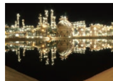
A plant in Thailand where Sumitomo Chemical licensed its propylene oxide production method