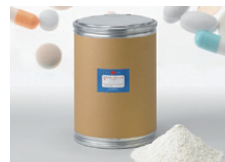
Active pharmaceutical ingredients