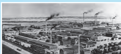
Japan Dyestuff Manufacturing Company Kasugade Works