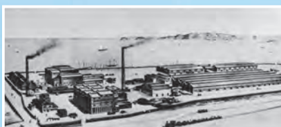
Sumitomo Fertilizer Manufactory

The Sumitomo Fertilizer Manufactory was founded to prevent pollution caused by gas emissions from copper smelting