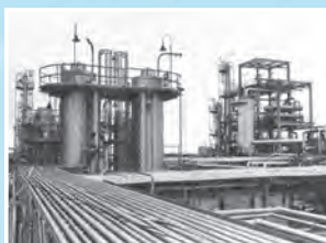
Ethylene Plant (Ohe, Ehime)