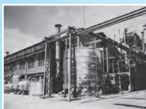
Pynamin Plant (Torishima, Osaka)