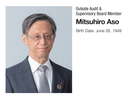
□14/16 times (88%) O13/15 times (87%)

1988 Joined Sumitomo Chemical Co., Ltd. 2023 Standing Audit & Supervisory Board Member (current)