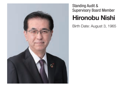
■ 6,800 □ -/- times (-%) O -/- times (-%)

1979 Joined Sumitomo Chemical Co., Ltd. 2019 Standing Audit & Supervisory Board Member (current)