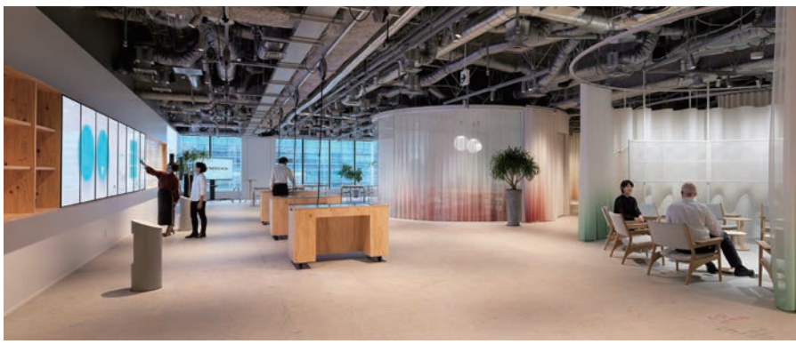
A look at SYNERGYCA

The building concrete floor kept as is and the bare ceiling with pipes and others create a special atmosphere for interaction and discussion. In addition, in order to create a meaningful opportunity for each visitor, the program is tailored to the visitor's interests, and visit and discussion can be carried out both real and online.