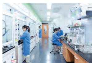
Osaka Research Center