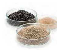
Super engineering plastics