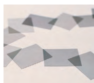
Polarizing films "SUMIKARAN"

The IT-related Chemicals Sector provides a wide range of products to support the age of IoT: optically functional films, touch screen sensor panels, color resists and polymer OLED materials that are used to make LC and OLED displays; photoresists and high-purity chemicals required in the semiconductor manufacturing process; compound semiconductor materials used in antenna switches and other components of communication terminal equipment.