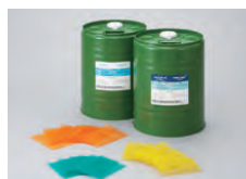
Products used for insecticides