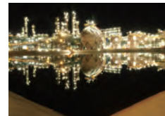
A plant in Thailand where Sumitomo Chemical licensed its propylene oxide production method