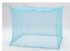
Olyset™Plus, long-lasting insecticidal mosquito net for malaria prevention