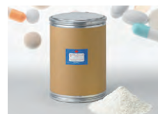
Active pharmaceutical ingredients