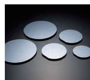
Compound Semiconductor materials