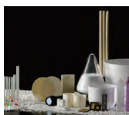
Products made using alumina and alumina powder

The Energy & Functional Materials Sector provides a wide variety of functional chemical products that contribute to reducing the environmental impact and conserving energy and natural resources, including inorganic materials such as alumina used in energy-saving products, high-performance polymer additives, super engineering plastics and lithium-ion secondary battery material used in electronic components and next-generation vehicles.