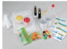
Various products made using polyethylene