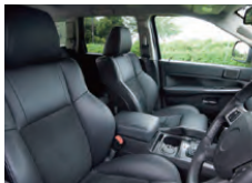
Automobile seats with cushion materials made using propylene oxide as a raw material

The Essential Chemicals & Plastics Sector has manufacturing facilities in Japan, Saudi Arabia, and Singapore, and leverages the strengths of each of these facilities to manufacture synthetic resins such as polyethylene, polypropylene, and methacrylic resin, as well as raw materials for synthetic fibers, and various industrial chemicals. Through these operations, Sumitomo Chemical meets the diverse needs of customers by providing chemical products that underpin a variety of industries.