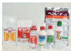
Various crop protection chemicals, including insecticides and herbicides

The Health & Crop Sciences Sector is engaged in the manufacture and sale of crop protection chemicals, fertilizers, feed additives, household insecticides, products for control of infectious diseases, and active pharmaceutical ingredients and intermediates. By providing these products, Sumitomo Chemical aims to contribute to a stable supply of crops, help increase food production in response to an increase in the world population, prevent the spread of infectious diseases, and achieve hygienic and healthy lives.