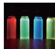
Polymer OLED inks