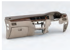
Automobile instrument panel made of polypropylene