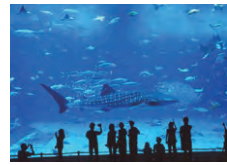
Large aquarium panel made of methyl methacrylate