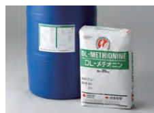
DL-methionine and methionine hydroxy analog used as feed additives