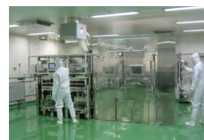
Manufacturing of PET radiopharmaceuticals