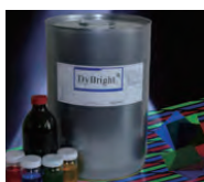
Color Resists "DyBright"